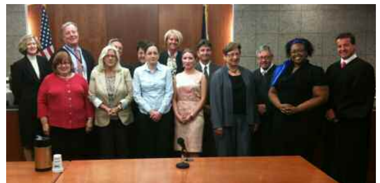
Members of CASA Training Class 43 along with Judges from Allegheny County Children's Court